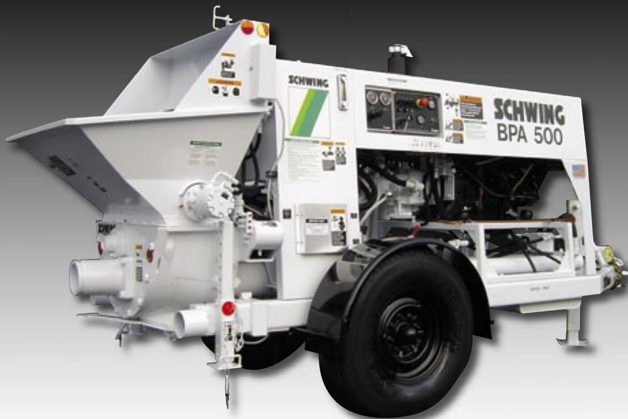
Shown with Optional Agitator